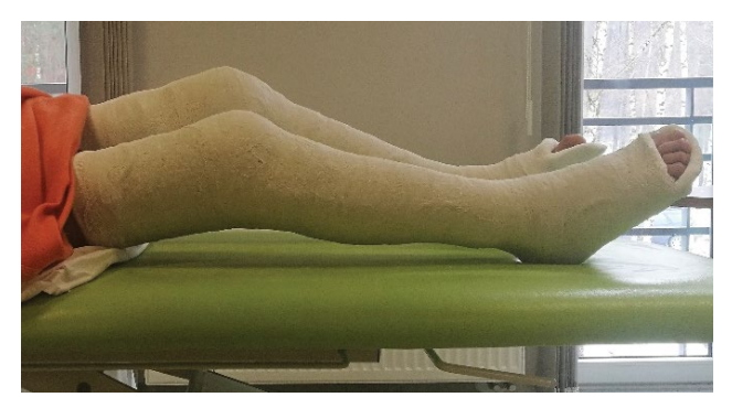
Figure 6: Right lower limb re-casted.