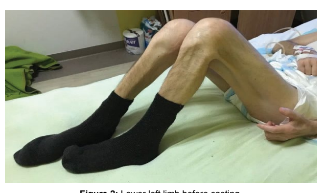
Figure 2: Lower left limb before casting