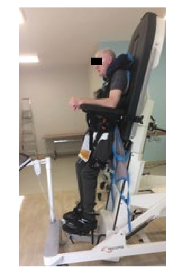
Figure 10: Verticalization in the Erigo vertical table.