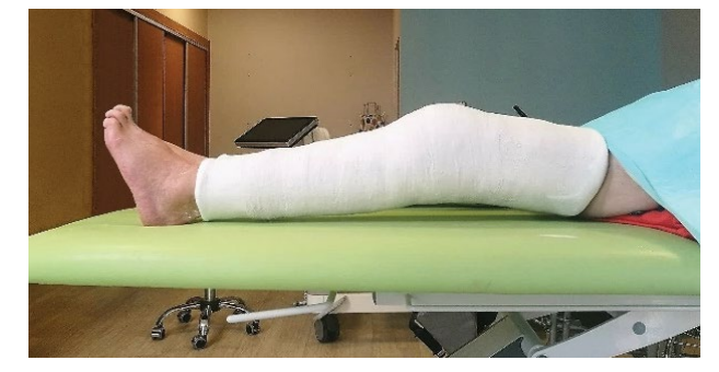
Figure 9: Left lower limb after two months of casting.